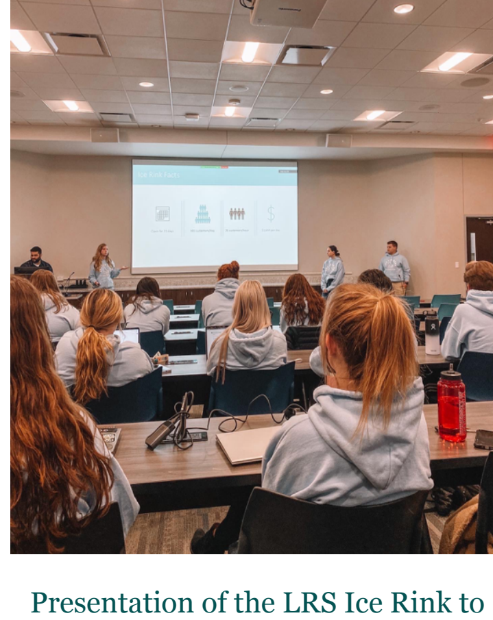
Presentation of the LRS Ice Rink to the Illinois Department of National Revenue