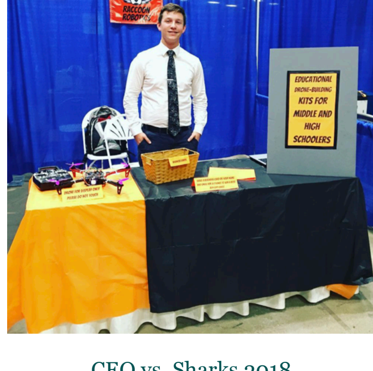
CEO vs. Sharks 2018