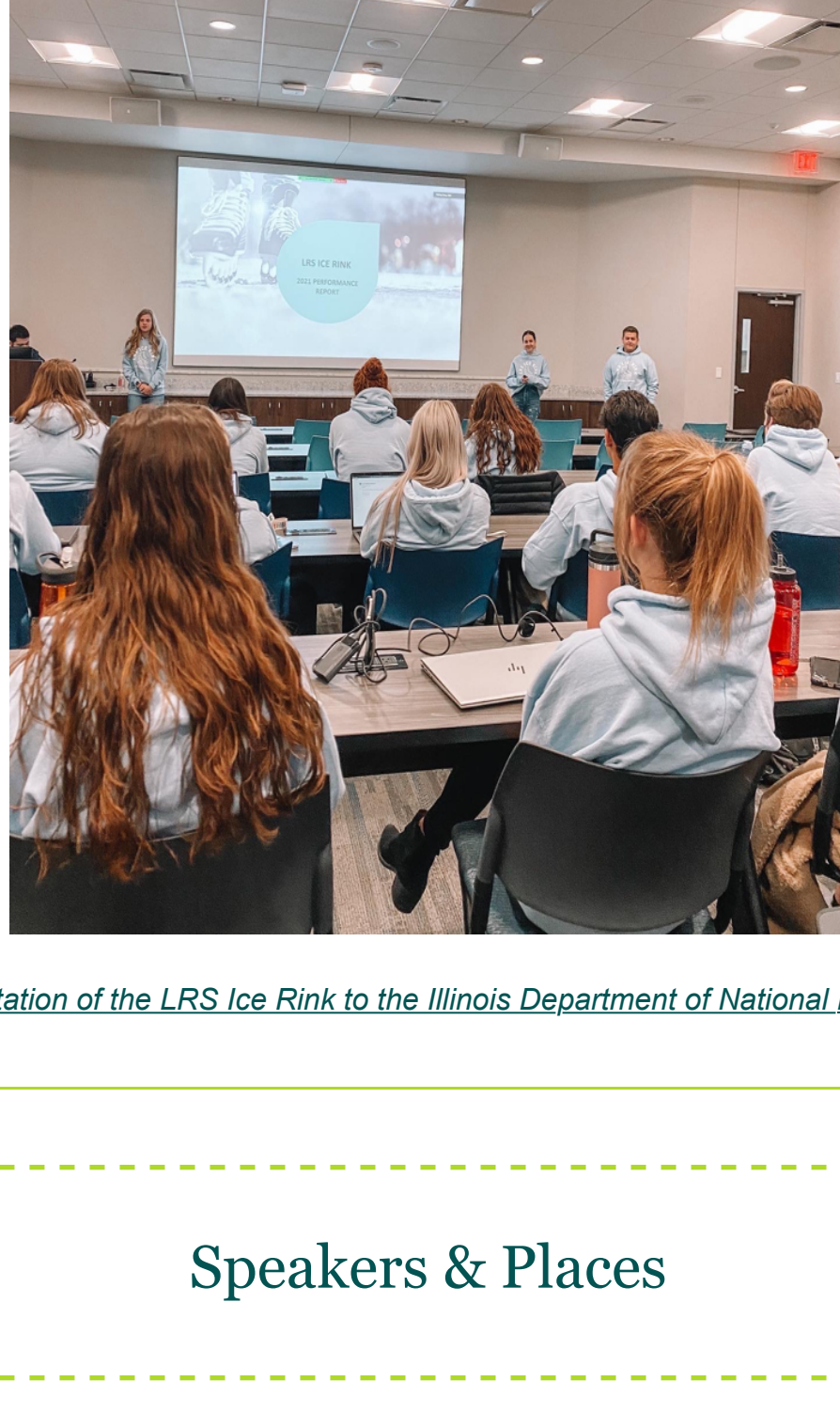
Presentation of the LRS Ice Rink to the Illinois Department of National Revenue