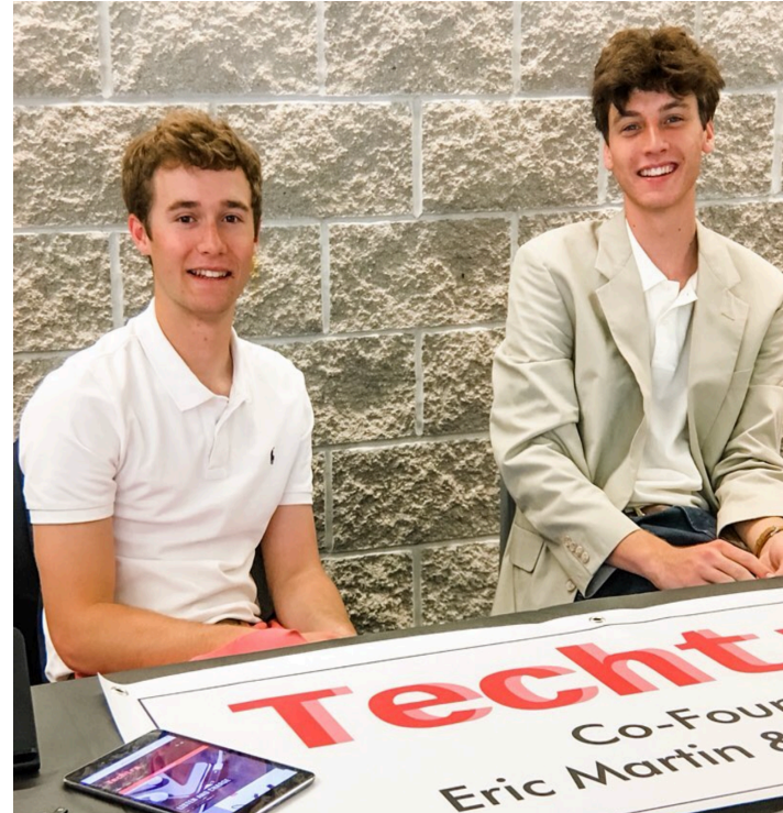
CEO vs. Sharks 2019