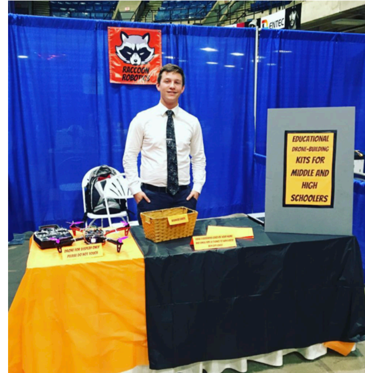
CEO vs. Sharks 2018